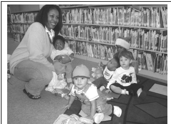
So many great books!!! Who will He send to read them?

“The man who does not read good books has no advantage over the man who cannot read them.” Mark Twain